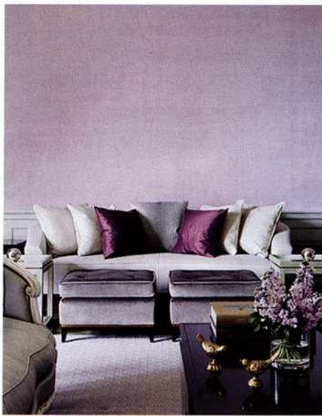
Far left, the Courtyard, which has a retractable glass roof. Left, the Drawing Room